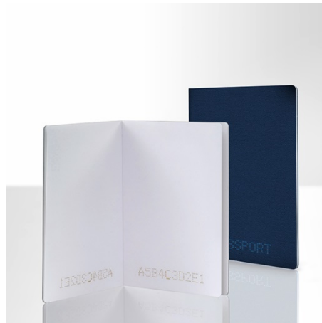
Laser marking on paper and card board: passports