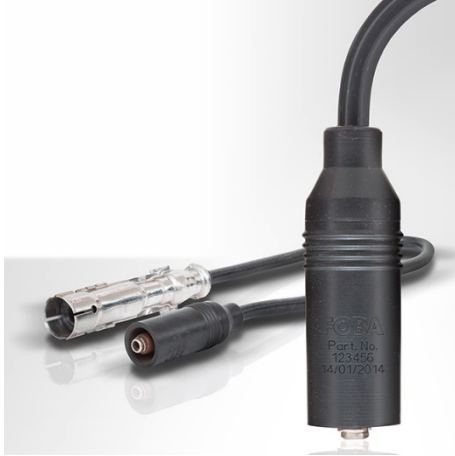
Ignition distributor with laser marks