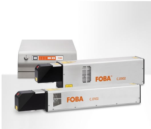
FOBA C.0102 and C.0302, 10- and 30-Watt-CO2-laser marking systems of the latest generation, offering a wide range of marking solutions for different materials and contents.