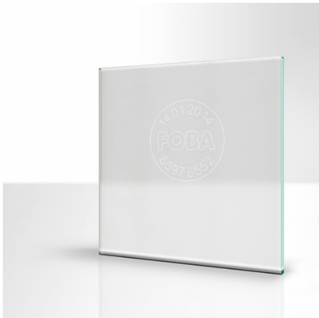
Window glass, laser marked