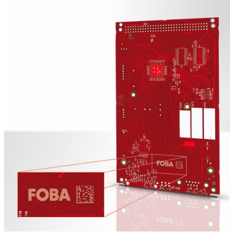
PC-board/printed circuit board