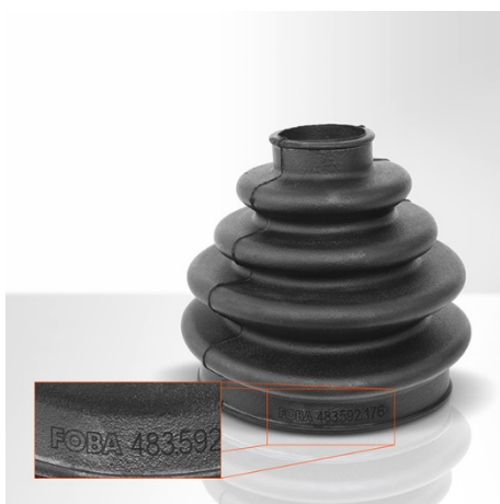
Plastic auto cuffs, laser marked